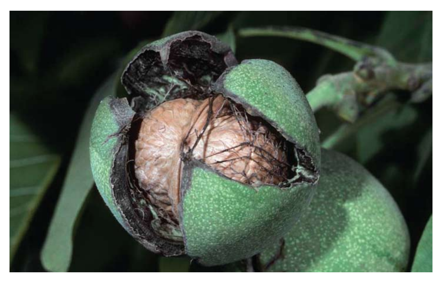
A ripe walnut, ready for harvest.